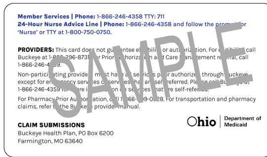
(ID Card Back)