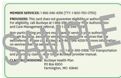
(ID Card Back)