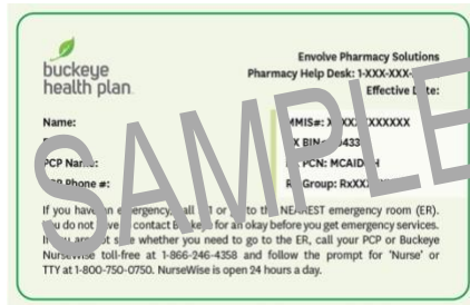
(ID Card Front)

If you are pregnant, you need to let Buckeye know. You must also call when your baby is born so we can send you a new ID card for your baby.