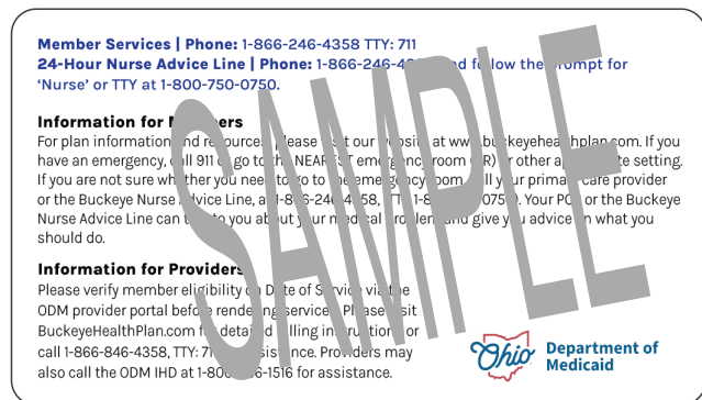
(ID Card Back)