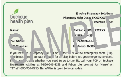
(ID Card Front)

If you are pregnant, you need to let Buckeye know. You must also call when your baby is born so we can send you a new ID card for your baby.