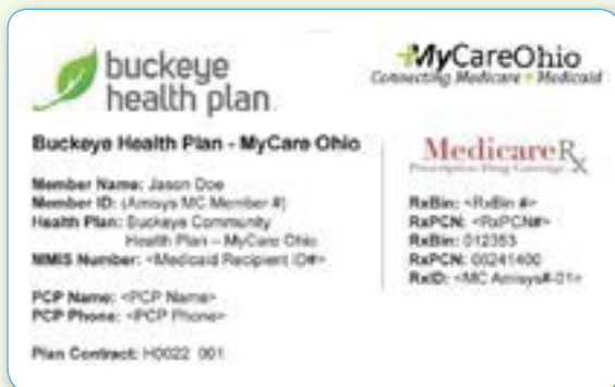
Buckeye MyCare Dual Benefits Member ID Card

Buckeye Health Plan Appeals Department 4349 Easton Way, Suite 300 Columbus, OH 43219